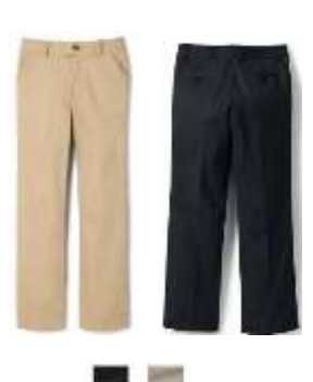
Plain Front Chino Pants