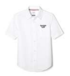
Short or Long Sleeve Monogrammed Dress Shirt (White)