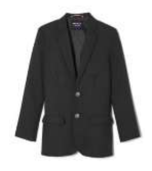
Men's Cut Bla