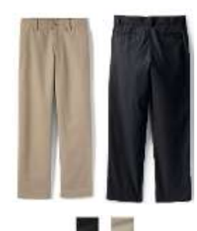
Plain Front Chino Pants