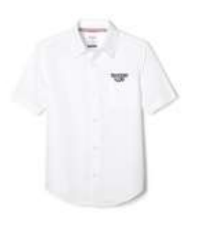
Short or Long Sleeve Monogrammed Dress Shirt (White)