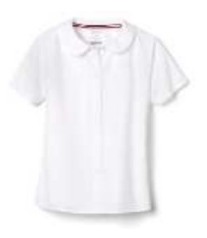
Short or Long Sleeve Peter Pan Collar Shirt