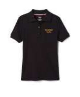
Short or Long Sleeve Monogramed Polo