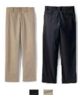
Plain Front Chino Pants