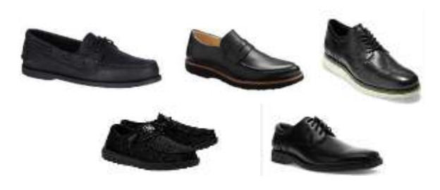
Chapel Shoe Options (Black)