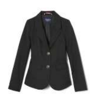
Women's Cut Blazer (Black)