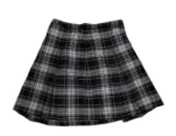
RSCA Plaid Skirt