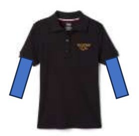
No short sleeve school polo layered with a contrasting color shirt underneath