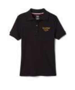
Short or Long Sleeve Monogramed Polo