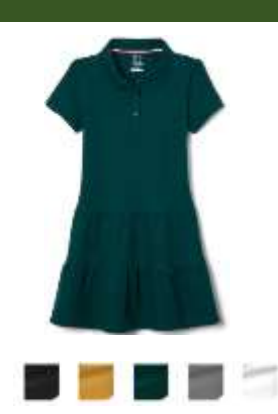
Short or Long Sleeve Monogrammed Polo Dress