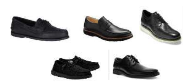
Chapel Shoe Options (Black)