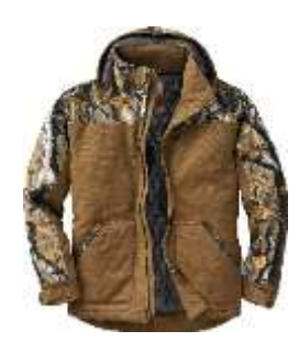
No Outerwear worn inside the building