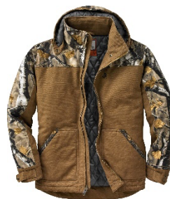
Outerwear worn inside the building