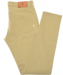
Khaki colored pants in a jeans style (rivets, exterior pockets, material)