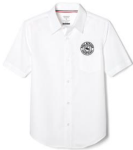
Short or Long Sleeve Monogrammed Dress Shirt (White)