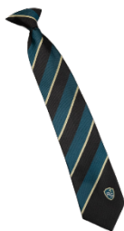
RSCA Stripe Necktie