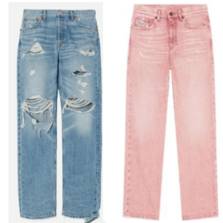
Friday jeans with rips, rubs, frays, or colors (even if there is fabric behind)