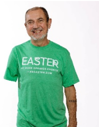
No church or youth group shirts