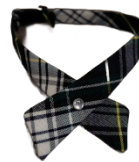
RSCA Plaid Crosstie