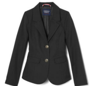
Women's Cut Blazer (Black)