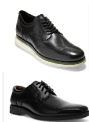
More Chapel Shoe Options (Black)