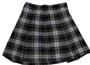
RSCA Plaid Skirt