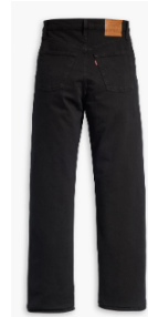
Black Jeans worn as uniform pants