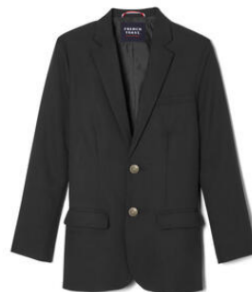
Men's Cut Blazer (Black)