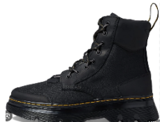
Military Style Shoes