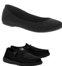
Chapel Shoes (Black)