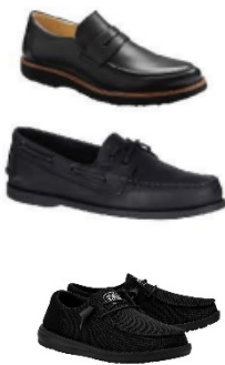
Chapel Shoe Options (Black)