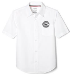
Short or Long Sleeve Monogrammed Dress Shirt (White)