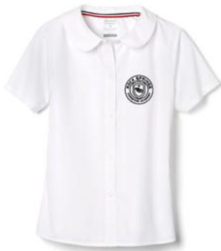
Short or Long Sleeve Monogrammed Peter Pan Collar Shirt (White)