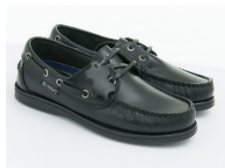
More black Chapel Shoe options