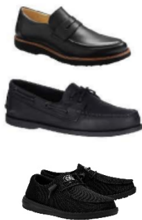
Chapel Shoe Options (Black)