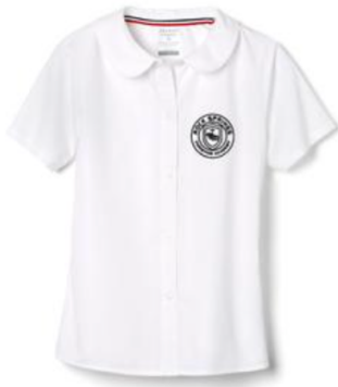
Short or Long Sleeve Peter Pan Collar Shirt