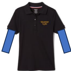
Short sleeve school polo layered with a contrasting color shirt underneath