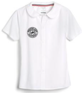
Monogram on the wrong side of the shirt