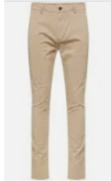
Slim fit or very tight pants