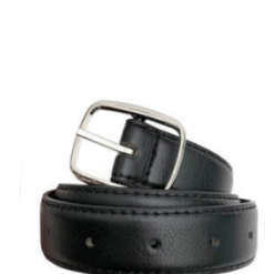
Chapel Belt (Black)