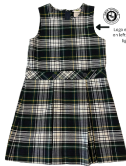
RSCA Plaid Jumper with Monogram